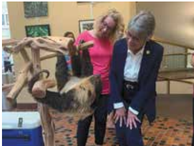
Just hanging around with Bean the Sloth from the Lehigh Valley Zoo during a recent visit to the Capitol.