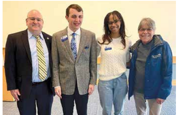
I enjoyed meeting with engaged student members of the Abington Social Change Initiative at Penn State Abington to discuss our state government.