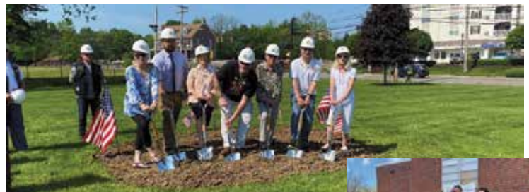
I was honored to attend the groundbreaking ceremony for Hatboro's Gold Star Garden. Thank you to the Borough and the community members who have come together to support this project, which will serve as a tribute to our fallen soldiers and their loved ones. The dedication ceremony is planned for September 25th at 11 A.M. at Miller Meadow Park.