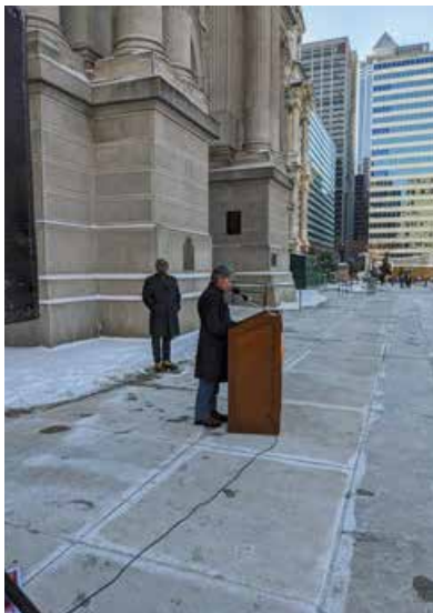
I spoke at the Asian Justice Rally in Philadelphia to advocate for equal rights and treatment for our AAPI community.