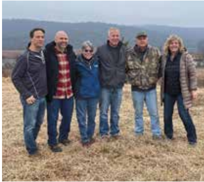
My colleagues from the Game and Fisheries Committee and I visited the Snow Geese and Black Ducks at the Middle Creek Wildlife Management Area.