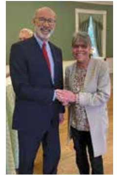
I met with Gov. Tom Wolf in preparation for this year's work on the state budget.