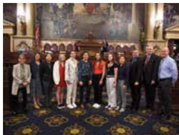
I was honored to welcome to the State Capitol this spring the Hatboro-Horsham Girls Swim Team, first time winners of the AAA State Championship.