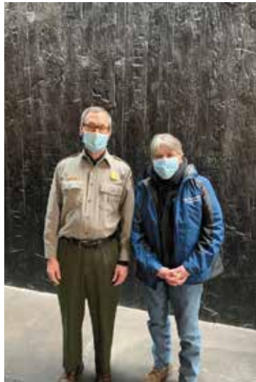
Paying my respects at the Flight 93 National Memorial in Stoystown, PA.